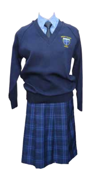
Winter skirt and jumper