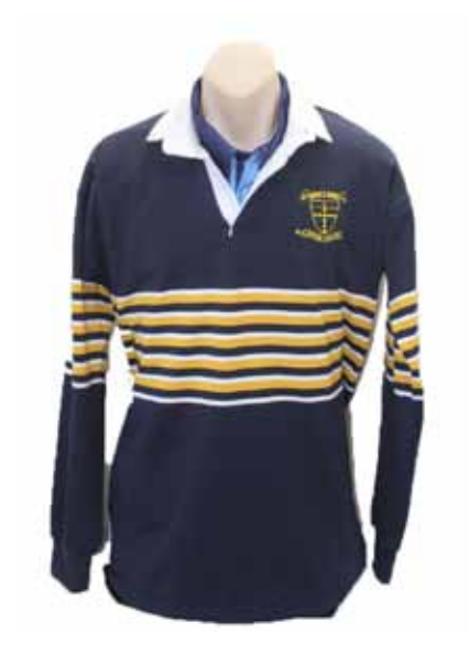
Sports Rugby Top