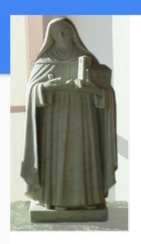
Brigid of Kildare is a patroness of those who have a care for the earth, for justice and equality, for peace and reconciliation. She is a model for a contemplative life.