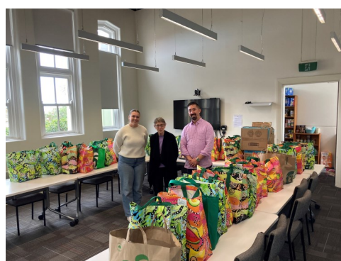
From Sacred Heart Primary school in Kew. This school contributes this every year on their feast day.