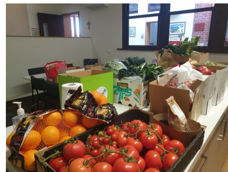
St Martins and Christ Church in South Yarra are amazingly generous to BASP and often bring in a large quantity of food and groceries.