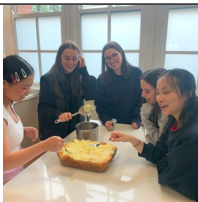
Students from St Columba's College in Essendon visited BASP Office and cooked a couple of dishes with the women who live in the BASP house in Albert Park. It was a great experience.